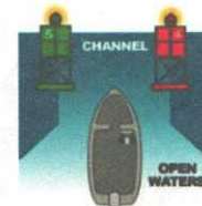
Red on your Right Returning up River